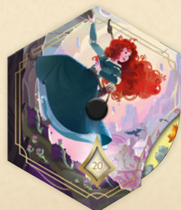
Touch the Sky lore counter

Scan here for supported localized instructions.