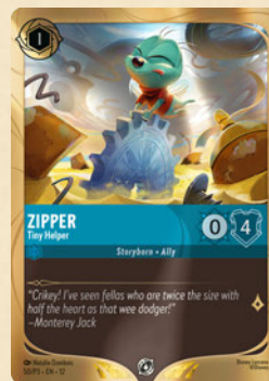
Zipper – Tiny Helper promo card