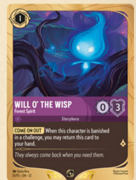
Will o’ the Wisp – Forest Spirit promo card