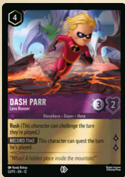
Dash Parr – Lava Runner promo card