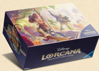
Wilds Unknown storage boxes