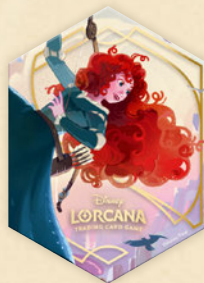
Touch the Sky stickers