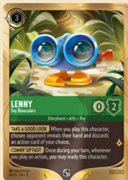
Lenny – Toy Binoculars promo card