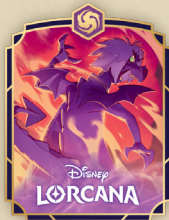
Madam Mim – Purple Dragon pin