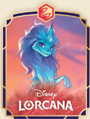
Sisu – Emboldened Warrior pin