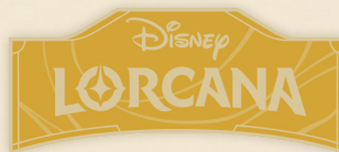
Disney Lorcana logo pin