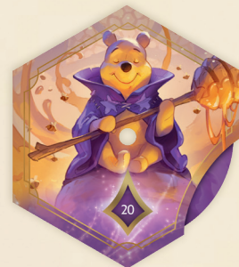
Winnie the Pooh – Hunny Wizard lore counter

Please note that this kit and its contents are not for resale. For details, please refer to the Disney Lorcana Hobby Store Program Terms & Conditions.