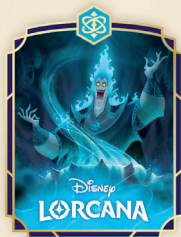
Hades – Infernal Schemer pin