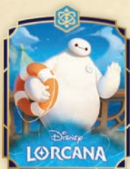
Baymax – Personal Healthcare Companion pin