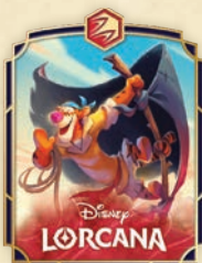
Tigger – In the Crow's Nest pin