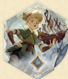
Tinker Bell – Giant Fairy lore counter

Please note that this kit and its contents are not for resale. For details, please refer to the Disney Lorcana Hobby Store Program Terms & Conditions.